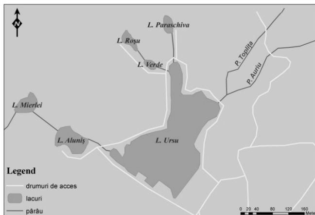
Fig.2. Sovata lacustrine complex

Of the seven existing lakes, only one is artificial, Lacul Negru, the others being of natural origin, namely karstic saline lakes. The lakes are the following in order of their importance: Ursu, Aluniș, Verde, Roșu, Mierlei and Paraschiva. The latter category of lakes was formed on the place of some dolines, where salt dissolution and subsidence phenomena took place.